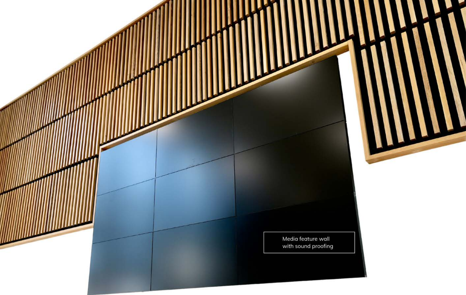
Media feature wall with sound proofing